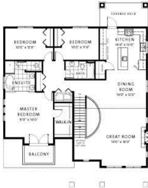
MAIN LEVEL 1,750 SQ FT